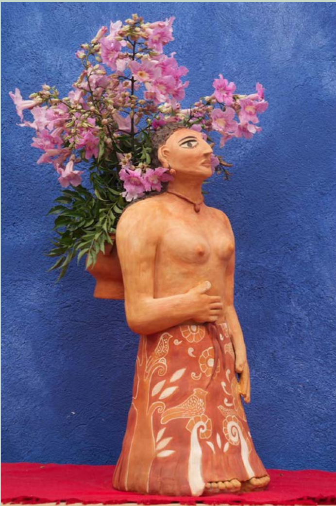
Maricela Gómez Mujer con Florero (Woman with Vase) , 2017 Oaxaca Clay 27.5 x 12 x 15.75 inches