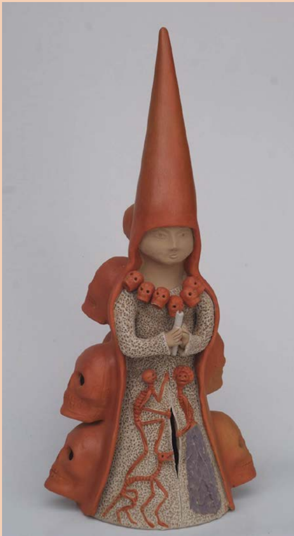
Leticia García Blanco Guardián de las Penumbas (Guardian of Darkness) , 2016 Ceramic 24 x 11 x 9 inches