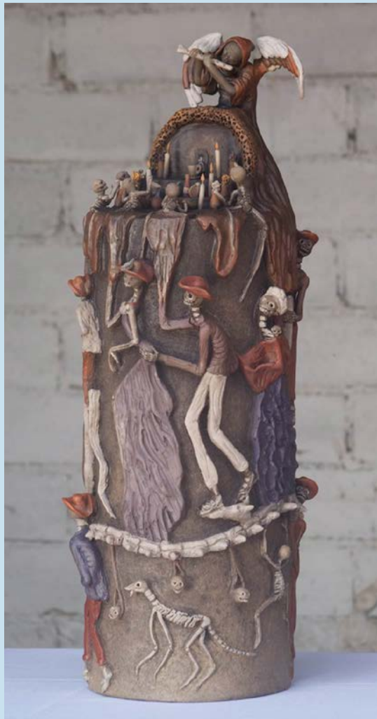
Fernando Félix Peguero García El Inframundo (The Underworld) , 2016 Ceramic 20.5 x 6.5 x 6.5 inches