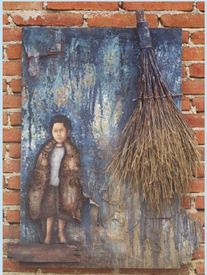
Fernando Félix Peguero García Nostalgia , 2014 Paint, mixed woods 38.75 x 29 x 4 inches