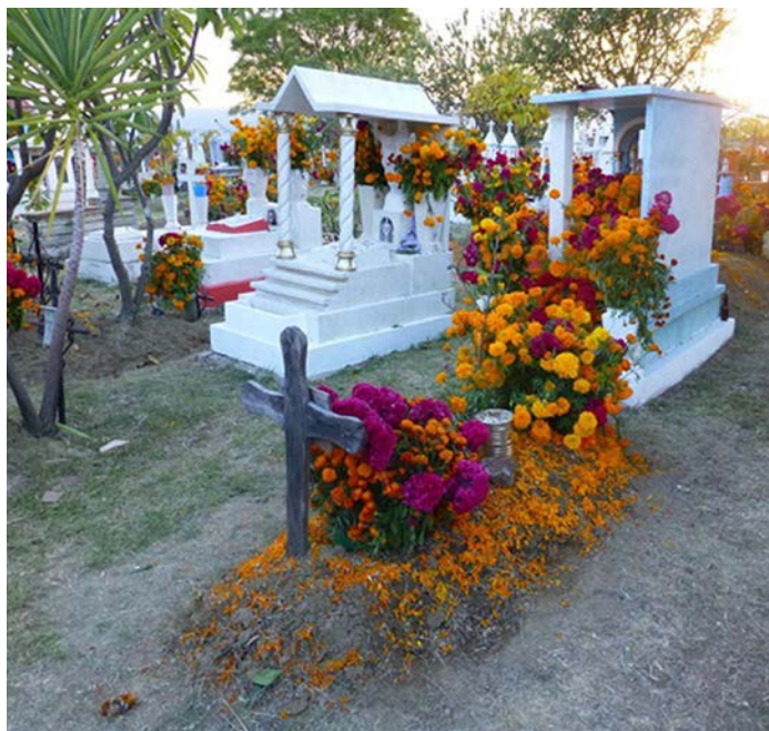
A typical "Day of the Dead" altar at a gravesite in Ocotlán.