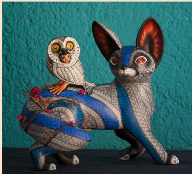
Giovanni Melchor Ramos Ocelot Dalí , 2017 Wood, paint 10.25 x 10.25 x 6.75 inches