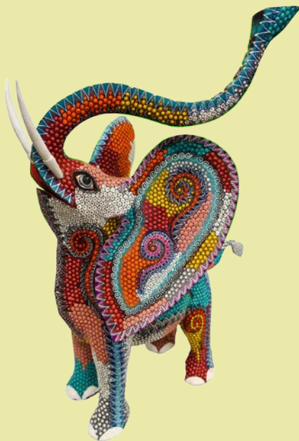
German Palomeque Jahan from Oaxaca's Cuenca de Papaloapam Region Elefonte (Elephant) , 2017 Wood, paint 18 x 9.5 x 12.75 inches

F rom the hands of the indigenous peoples of Oaxaca—the Mixes, Chinantecos, Chatinos, and Zapotecos—come these magical carved and decorated works. These artisans use crooked sticks of cedar, willow, pine, and aguacatillo to create artworks that speak of the spirit. Full of color and mystery these works arise out of the people's centuries-long coexistence with the surrounding salvific forests, where the colors of heaven are mixed with those of nature. This wonderful range of chromatics gives light to the imagination of Tribús Mixes in barely worked, incredibly plastic forms that capture Oaxaqueña legends. These works are expressions not only of one of the most ancient cultures of Mesoamerica but also of these artists' intimate coexistence with nature, to which they continually return to feed their spirits and to find their various ways of existing.