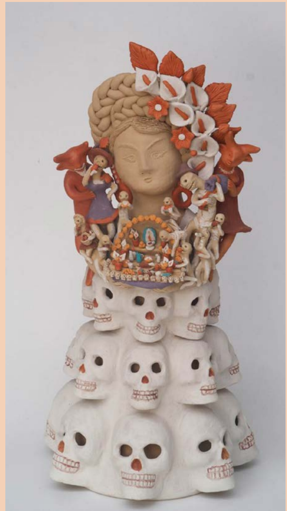
Leticia García Blanco La Ofrenda (The Offering) , 2017 Ceramic 21 x 10.5 x 10.5 inches