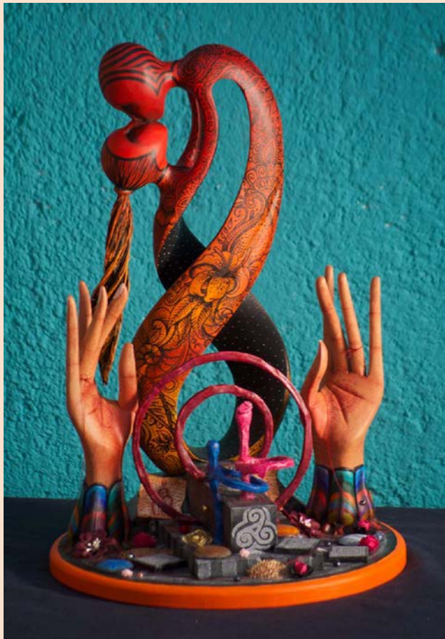
Giovanni Melchor Ramos Perfect Alchemy (Alquimia Perfecta) , 2017 Wood, paint 16.25 x 11 x 11 inches