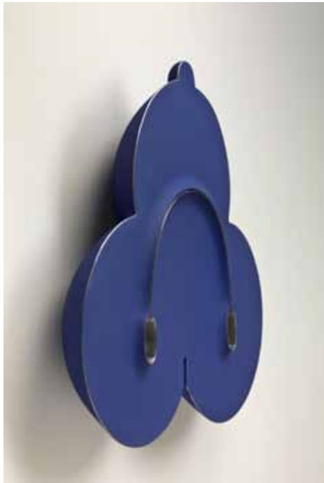
Blue Eyes side view