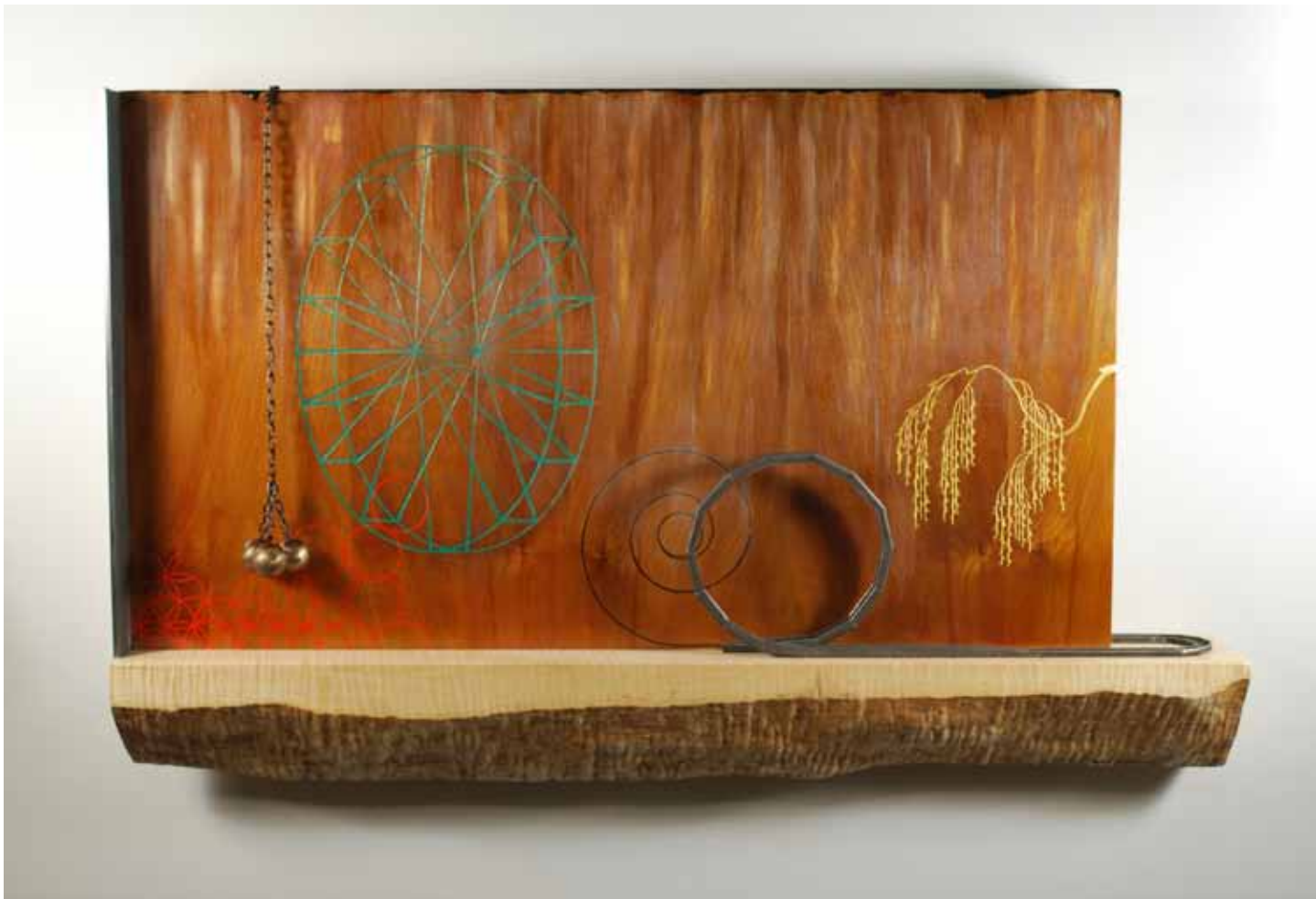
Bob-Lo , wood, steel, cast bronze, paint, gold leaf, 32" x 20" x 4", 2012