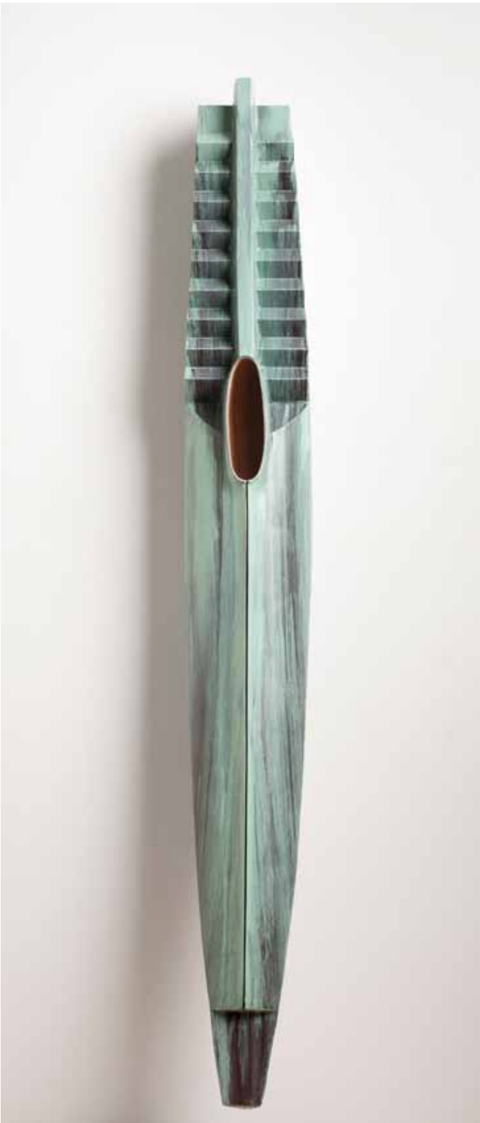
Zig-Zag Totem front view