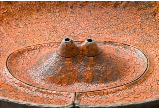
Detail of Twin Peaks