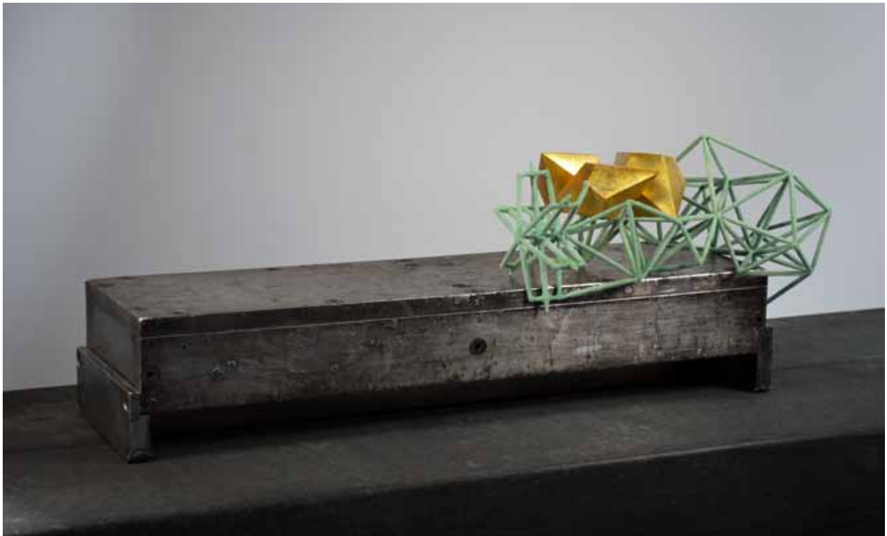
Propel , gilded cast rubber, flocked bamboo, aluminum, 21" x 8" x 7", 2011