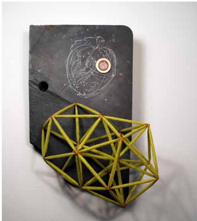
Evolove, slate, flocked bamboo, 12" x 8" x 6 ½", 2010