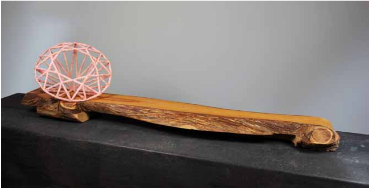
Pink Diamond , flocked bamboo, wood, 32" x 8" x 7", 2011