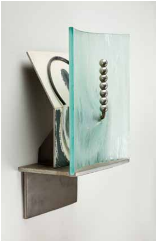
Spirit side view