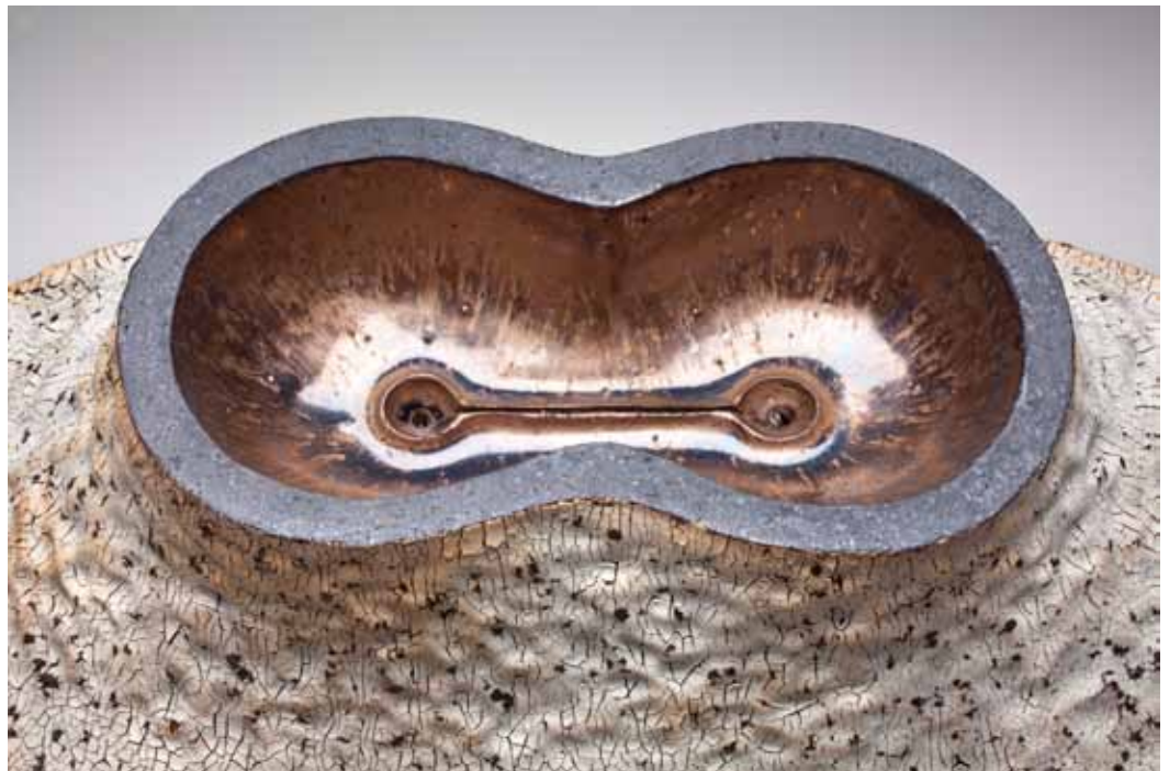
Detail of Plateau Vessel