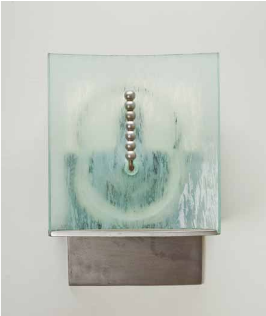
Spirit , steel, acid etched kiln formed glass, paint, 16" x 12" x 9", 2008