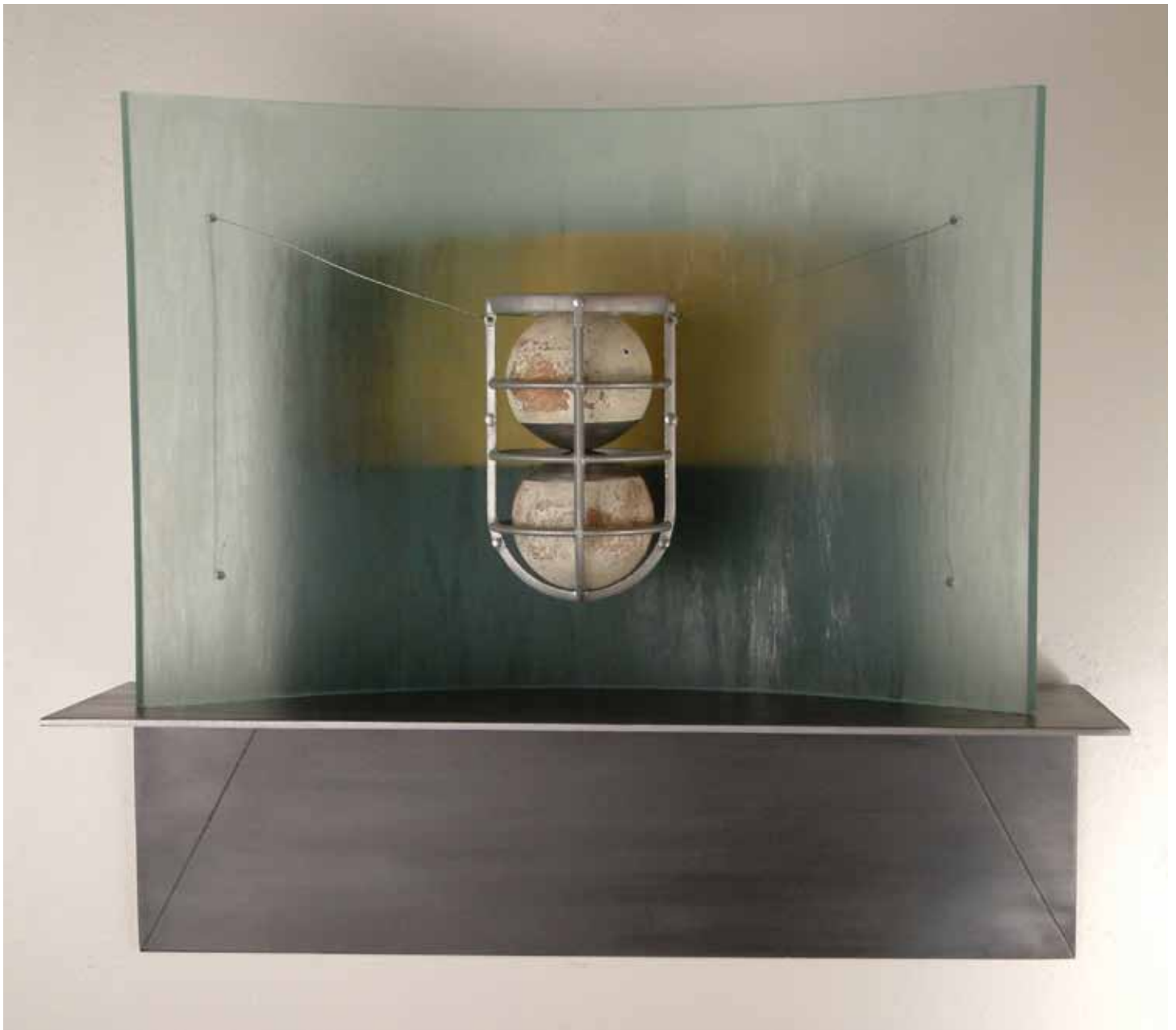
The Couple , ceramic, acid etched formed glass, steel, 16" x 24" x 10", 2008