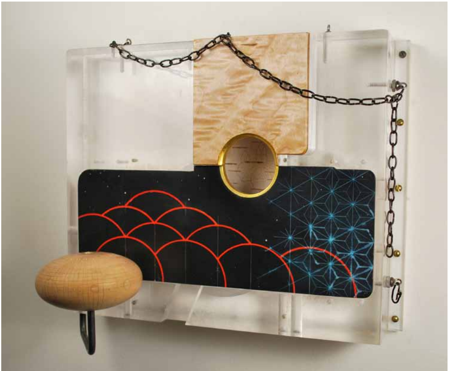
From Where I Came , acrylic, egg tempera on panel, boxwood, 15" x 12" x 7", 2011