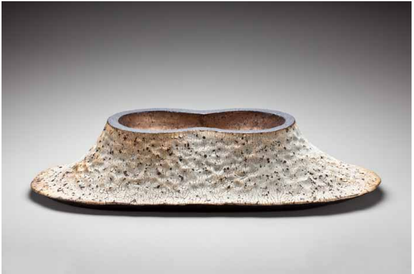
Plateau Vessel , ceramic, 7" x 10" x 23", 2010