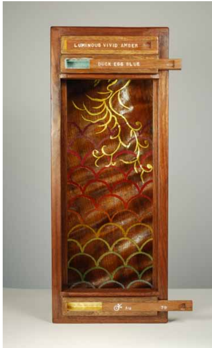
The Identity of Color , black walnut, curly redwood, flocking, gold leaf, 14 ¼" x 5 ½" x 5", 2011

I believe art has endurance and a power unequaled. Sometimes you observe or hear something so profound and powerful it resonates deeply in your body and mind. The unexplained alchemy stays with you long after the initial contact. That this happens is amazing because you can own this experience in a personal way without having to actually own what made you feel this way. So as a sculptor I work in my studio to try and replicate aspects of these experiences, re-appropriating what was seen or heard and sometimes felt.