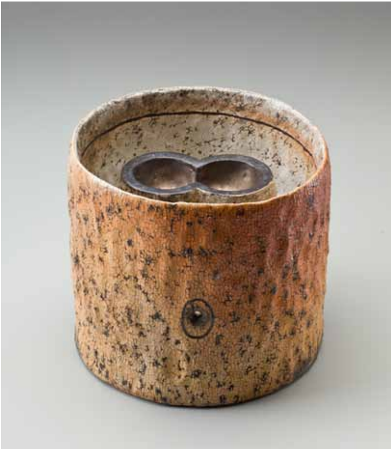
Double Mountain Vessel, ceramic, 8" x 9" diameter, 2011