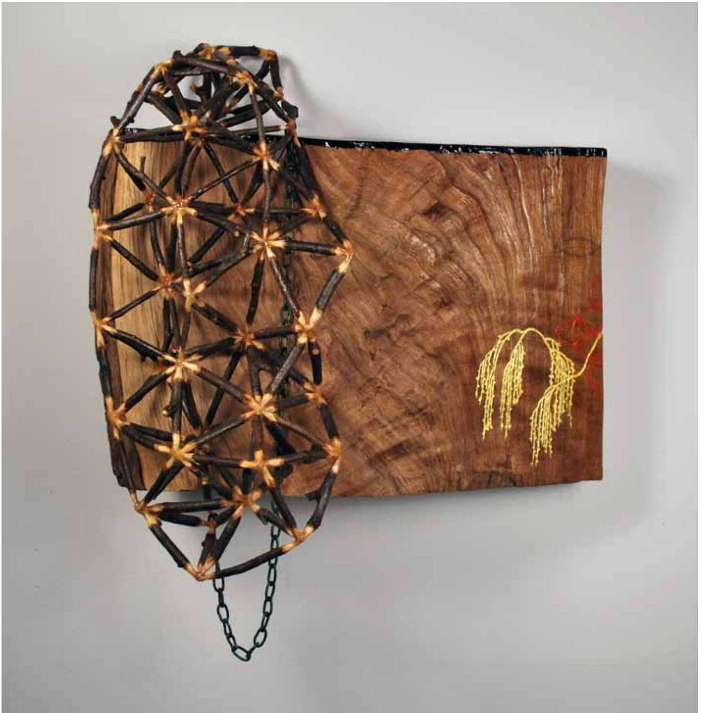
Ever Expanding , black walnut, gold leaf, egg tempera, 12" x 15" x 8", 2010