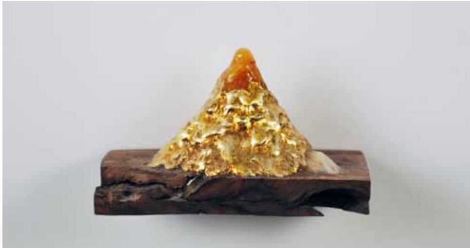
Mountain 1, glue, wood, silver leaf, 3 ¼" x 2" x 1 ¾", 2008