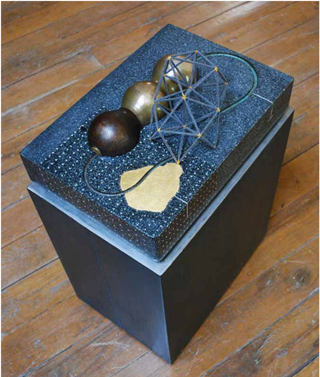
Subset , cast bronze, granite, gold leaf, flocked bamboo, 18" x 12 ½" x 5", 2010