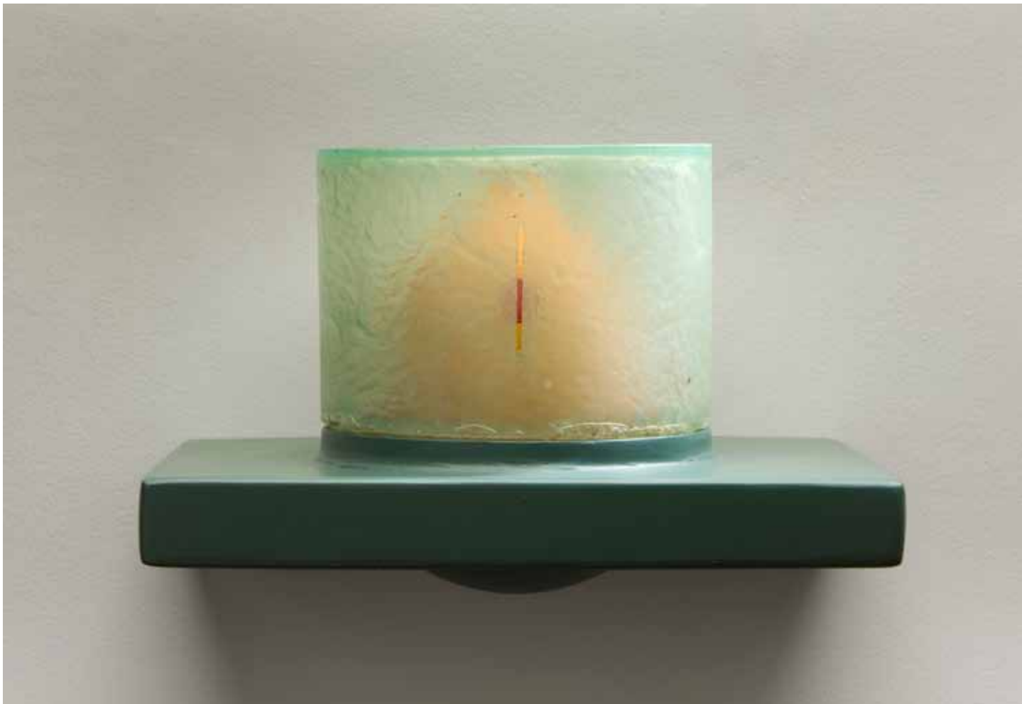
Inner Glow , resin, steel, foam, 7" x 11" x 8", 2008

In my art I try to distill universal forms and experiences to their core essence: Portals exposing hidden interior spaces; surfaces that have acquired a visual language of usage and time; ephemeral translucent elements that transmit only the essential outlines of form and color. These elements tell the human story—a yearning to understand the unknown. In much of my ceramic work, I reference distilled abstract landscape narratives, the vessel rims serve as a frame to house the interior imagery. Like a classical musician, I play the score over and over and try to put subtle changes and nuances within the series until I get it “right,” to have the form, color and surface all working together in a delicate balance.