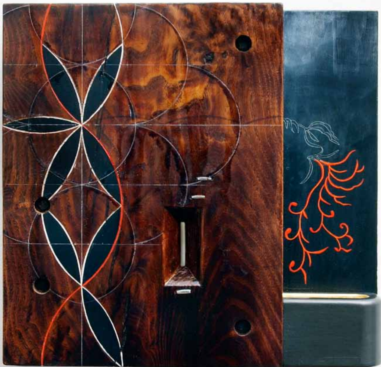
Confession , egg tempera, wood, polyethylene, 11" x 12" x 3", 2007