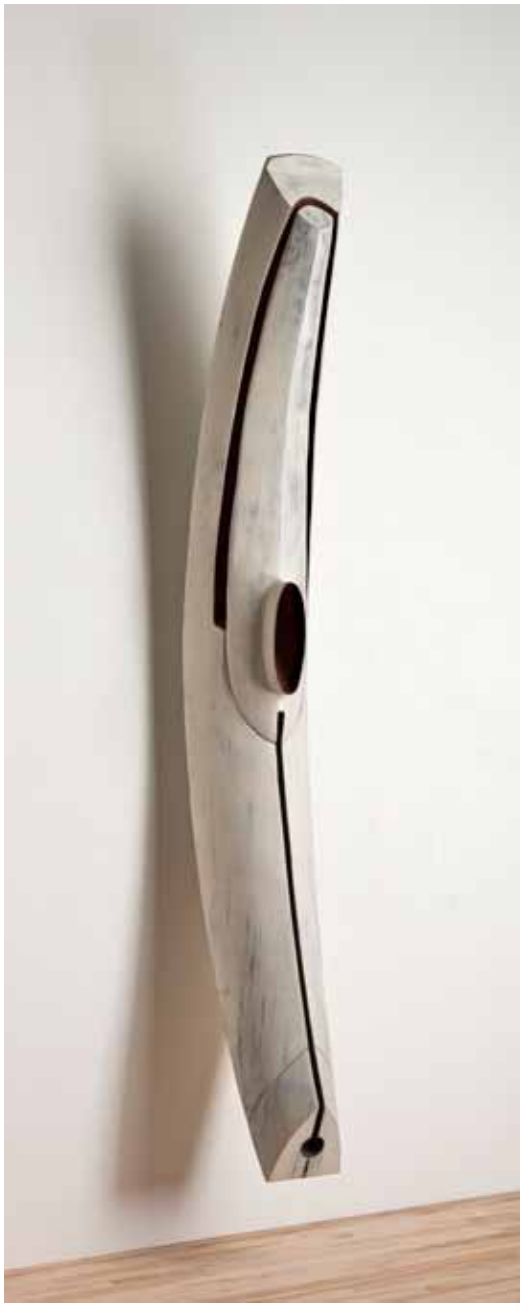
Inner Core , patinated steel, 102" x 16" x 20", 1999