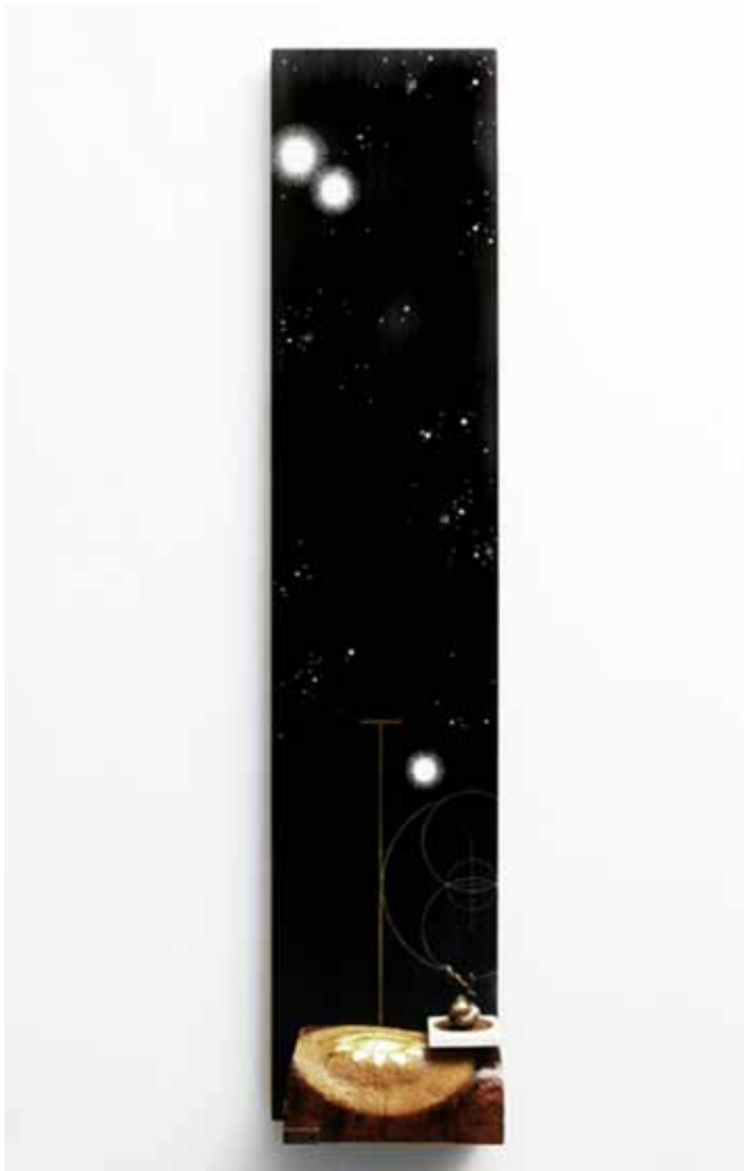
Telepathy , egg tempera on panel, cast bronze, wood, gold leaf, 61" x 13" x 6 ½", 2007