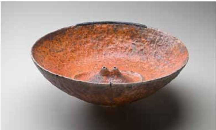
Twin Peaks, ceramic, 9" x 22" diameter, 2011