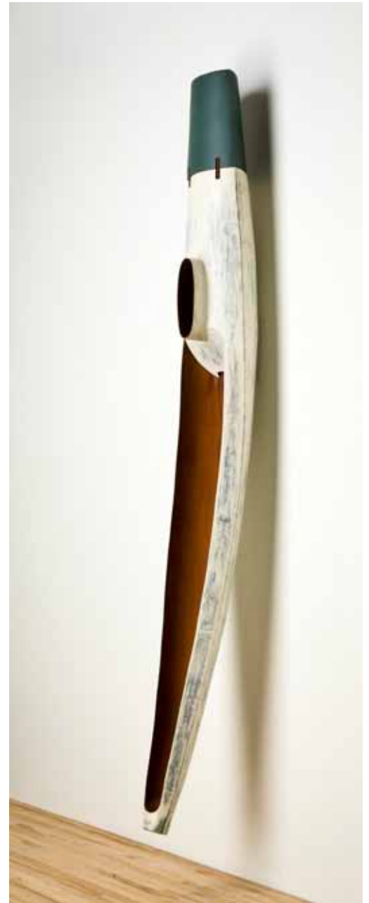
Open Core , patinated steel, 106" x 15" x 16", 2005