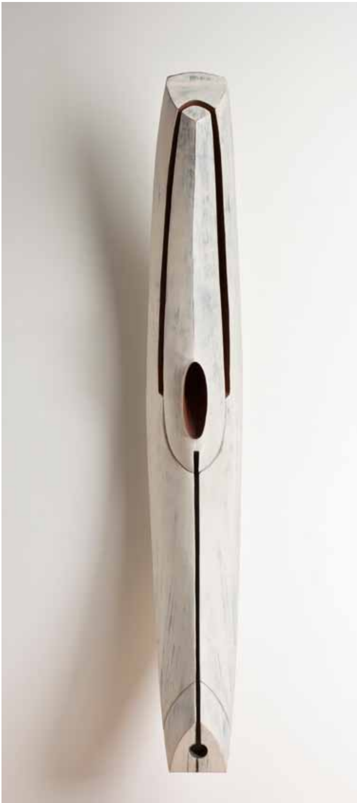
Inner Core front view