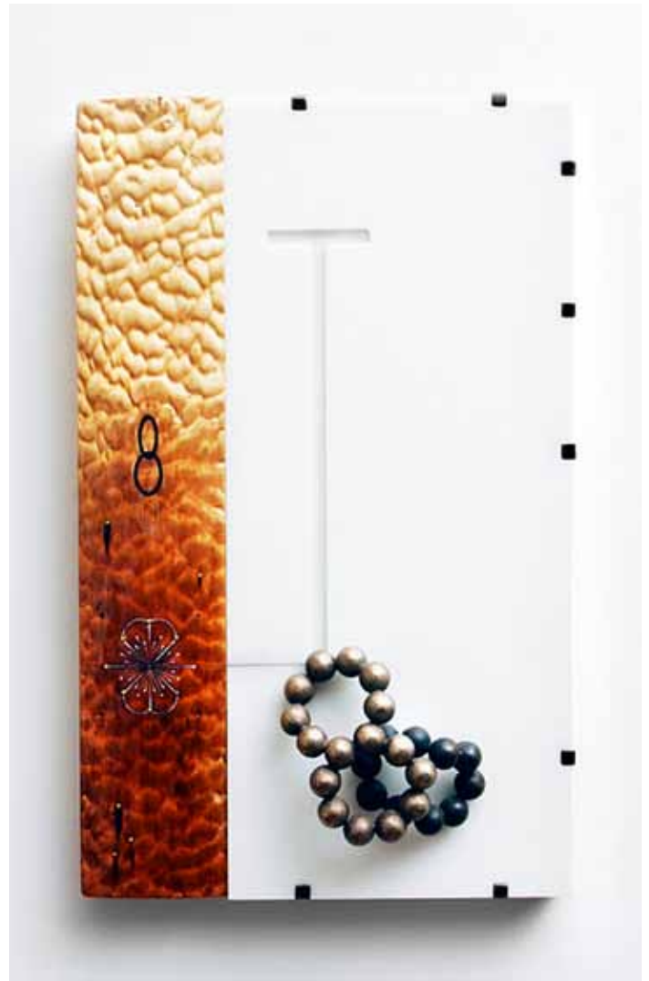
Invisible Link , wood, polyethylene, cast bronze, 25" x 15 ½" x 4 ½", 2005