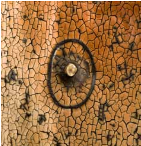
Details of Double Mountain Vessel