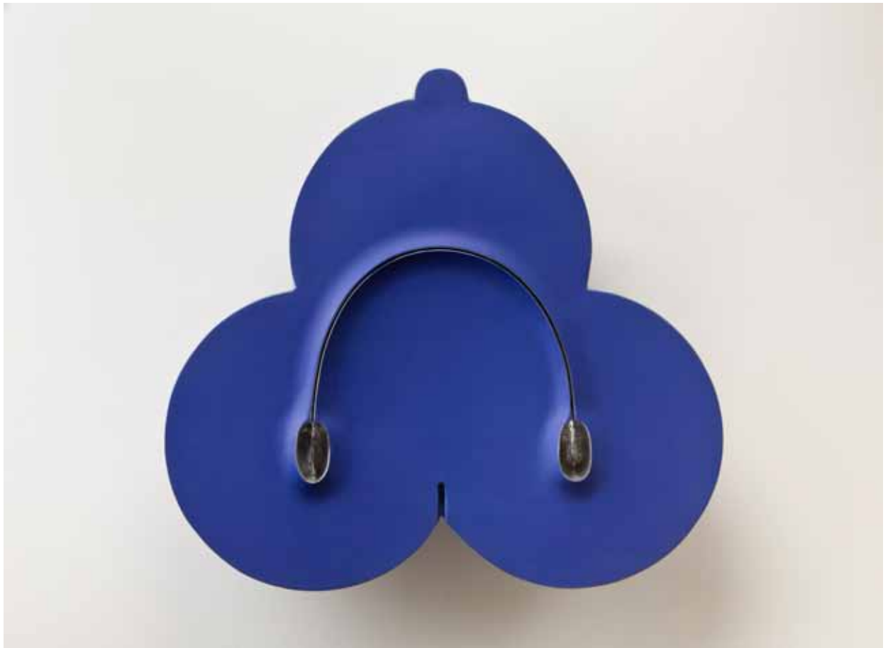
Blue Eyes , patinated steel, 28" x 30" x 8", 2011