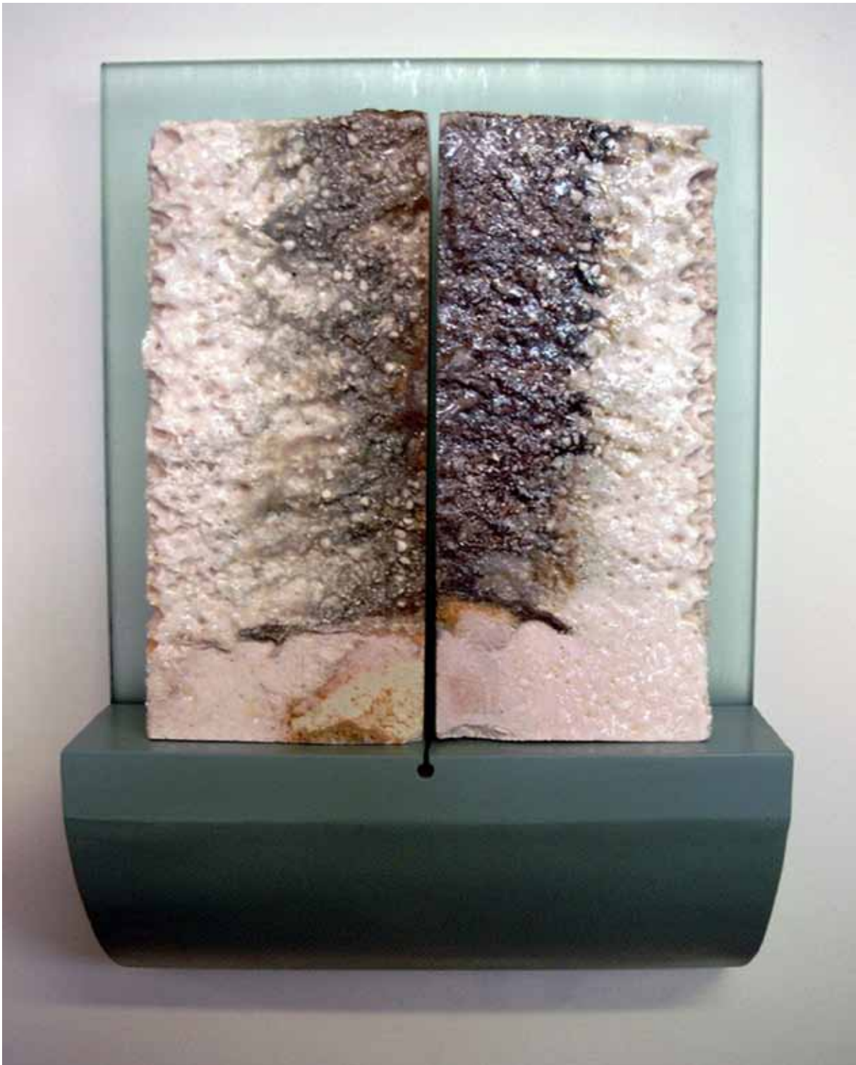
The Wall , ceramic, glass, steel, gold leaf, 20" x 16" x 8", 2010