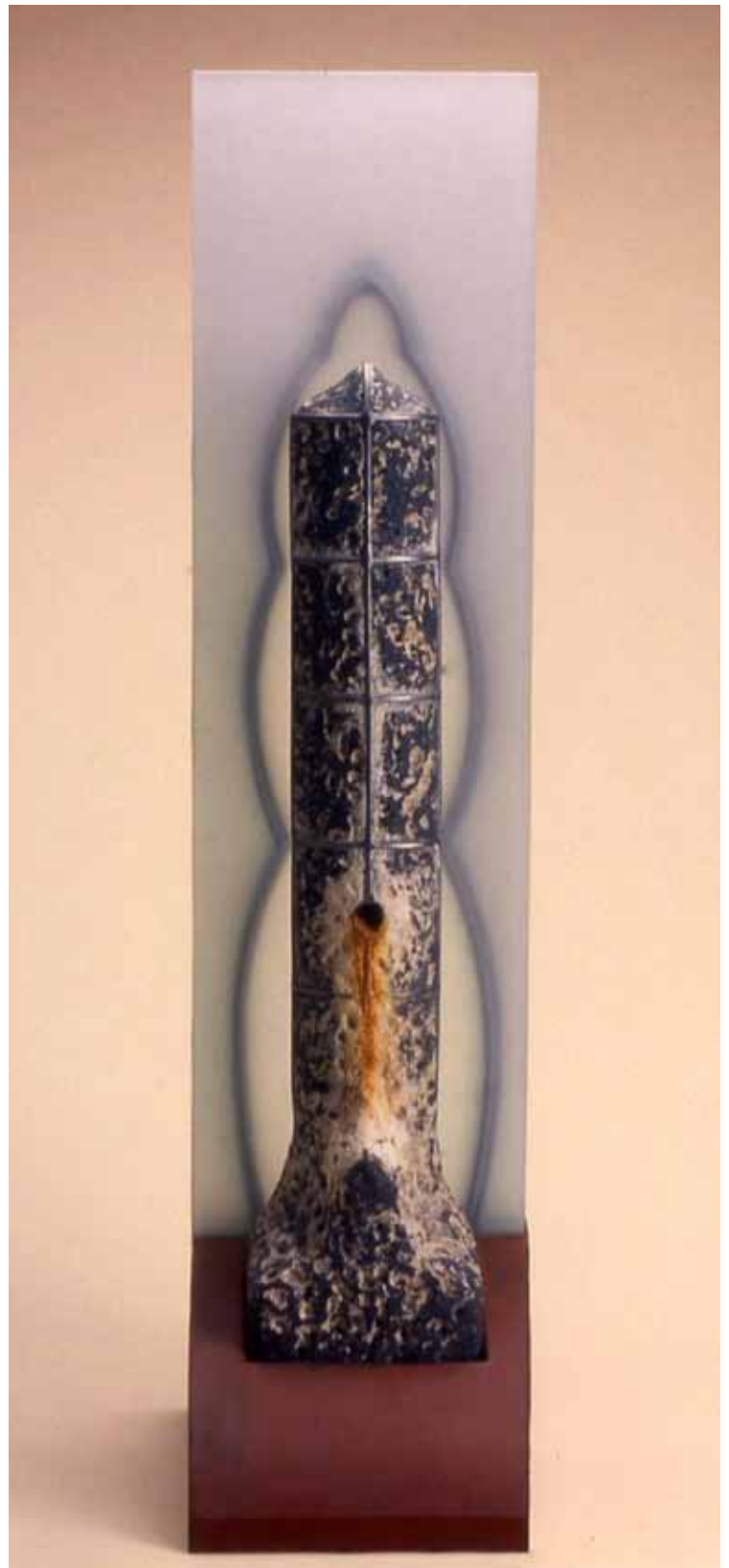
Temple Totem , adobe clay, glass, steel, 55" x 14" x 24", 2005