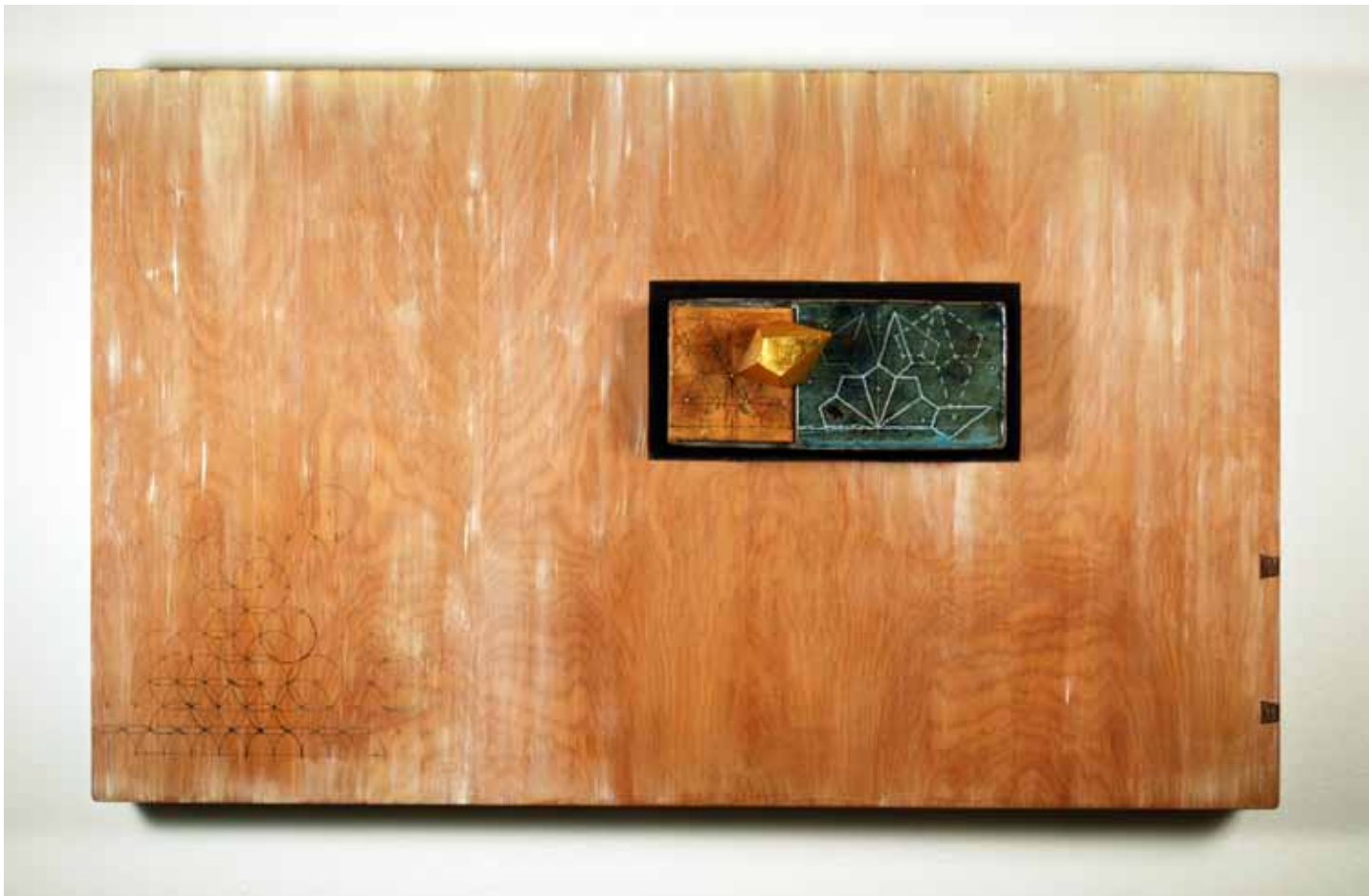
Aphonia , wood, ceramic, gilded cast rubber, 18" x 29" x 6", 2010