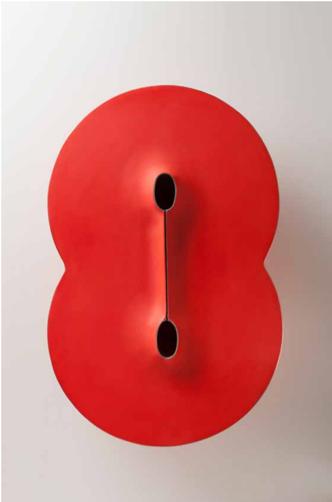
Red Bindu , patinated steel, 32" x 18" x 9", 2009