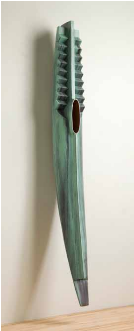
Zig-Zag Totem, 96" x 12" x 16", 2011