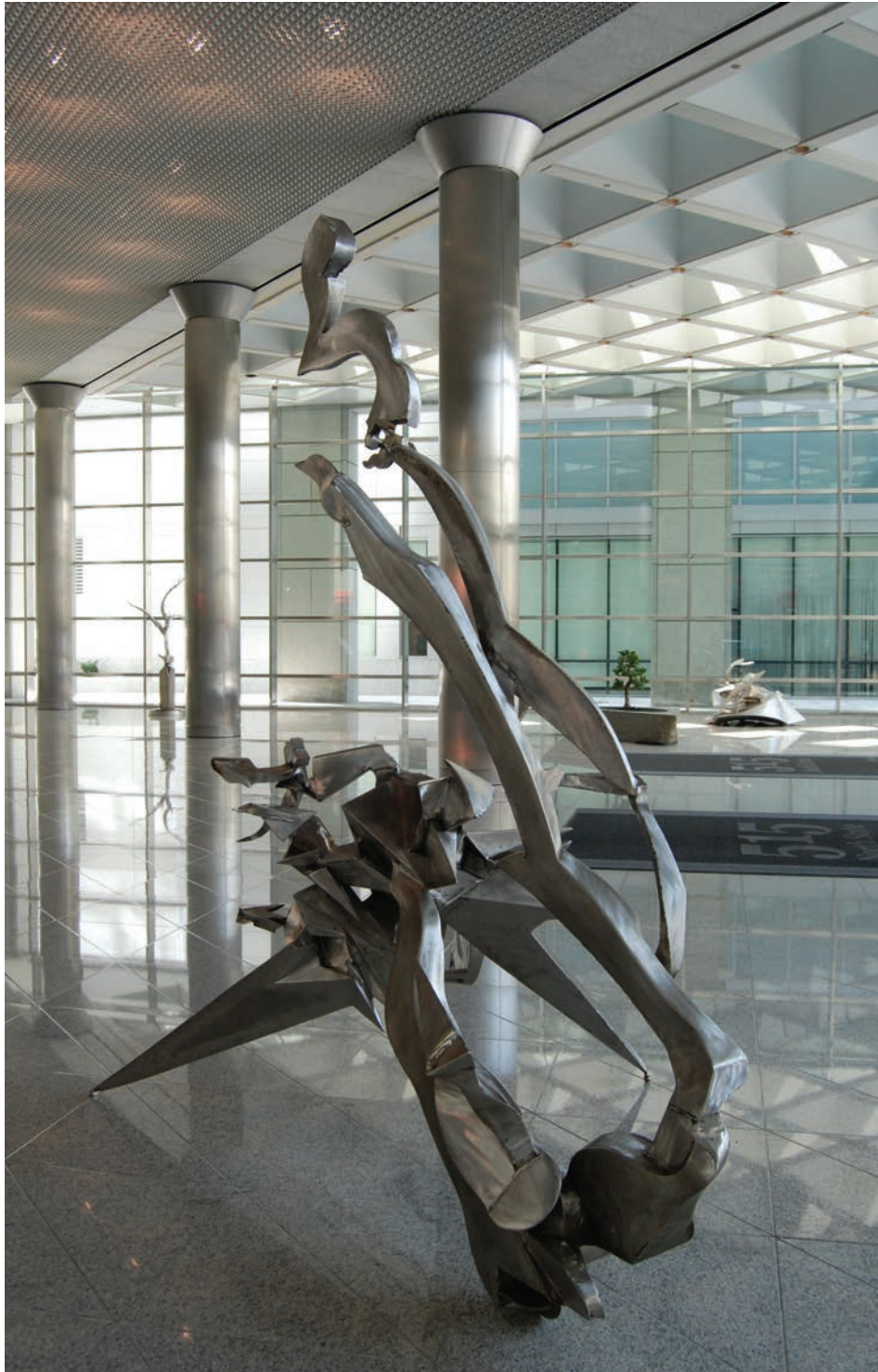
Which Way, Points of Reference and Departure , 1997 - 2010 Welded stainless steel 108" h x 80" w x 96" d