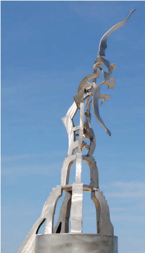
Tower of Aspirations , 2002 1" = 1' Scale Model Welded stainless steel 50" h x 16" w x 16" d