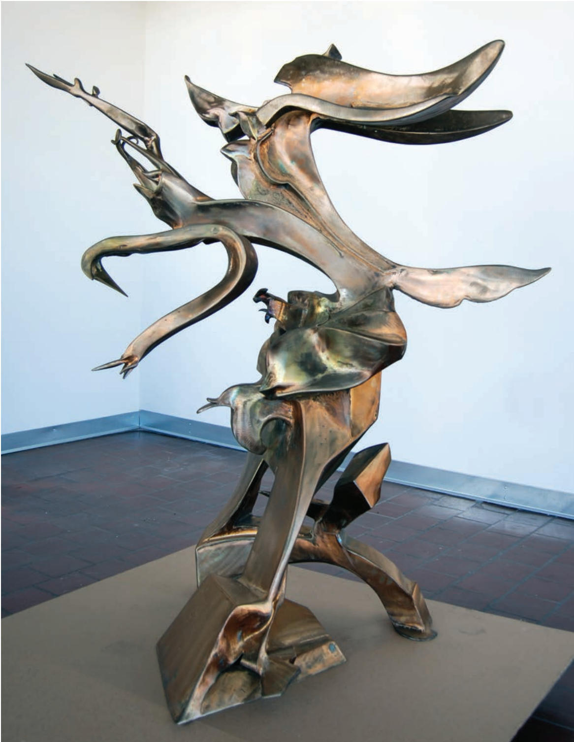
Rampant Heraldry , 2011 Welded bronze 55" h x 28" w x 59" d