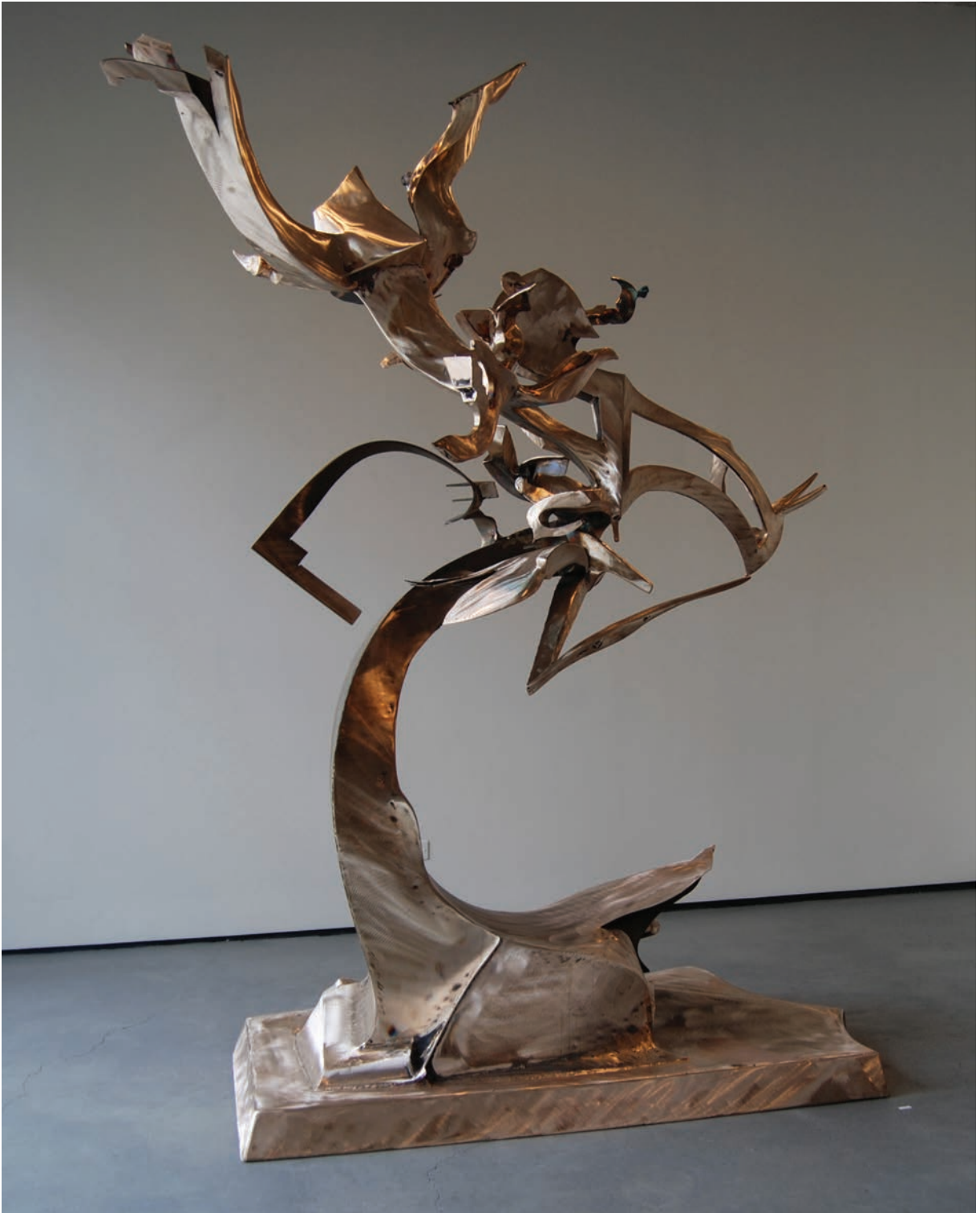
Sculptural Improvisation III , 2000 - 2009 Welded bronze 101" h x 85" w x 77" d