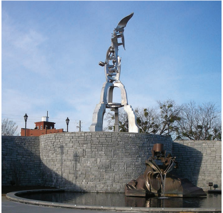
Tower of Aspirations and And They Went Down Both Into the Water , 2002 Springfield Village Park, Augusta, GA

a work that reflected his fascination with classical mythology and the tenets of surrealist art through his use of the hybrid motif. As with the European artists of the previous generation originally associated with that movement, the hybrid appealed to Hunt because it had unlimited potential for formal figurative, abstract and biomorphic variations and complexities, and evoking enigmatic and ambiguous interpretations. Ultimately, his sculptures are hybrids because they convey his predilection for fusing incongruous elements --- the organic with industrial, animal with human, abstraction with representation.