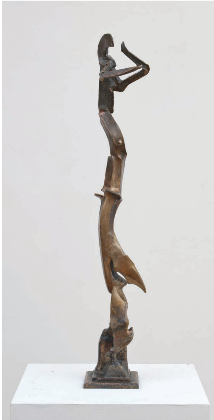
Twisted Fiddler , 2009 Cast and welded bronze 31 ¼" h x 6" w x 5" d