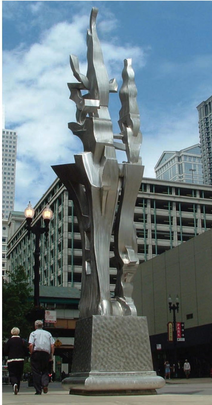
We Will , 2005

The Heritage at Millennium Park building is on Randolph Street across Garland Court from the Chicago Cultural Center just west of Michigan Avenue and Millennium Park. Hunt's commissioned 38-foot high welded stainless steel sculpture We Will was installed on a six square foot area of the public way leased from the city by the Mesa Development Company, the builders of the Heritage at Millennium Park. The building and sculpture were completed in 2005.