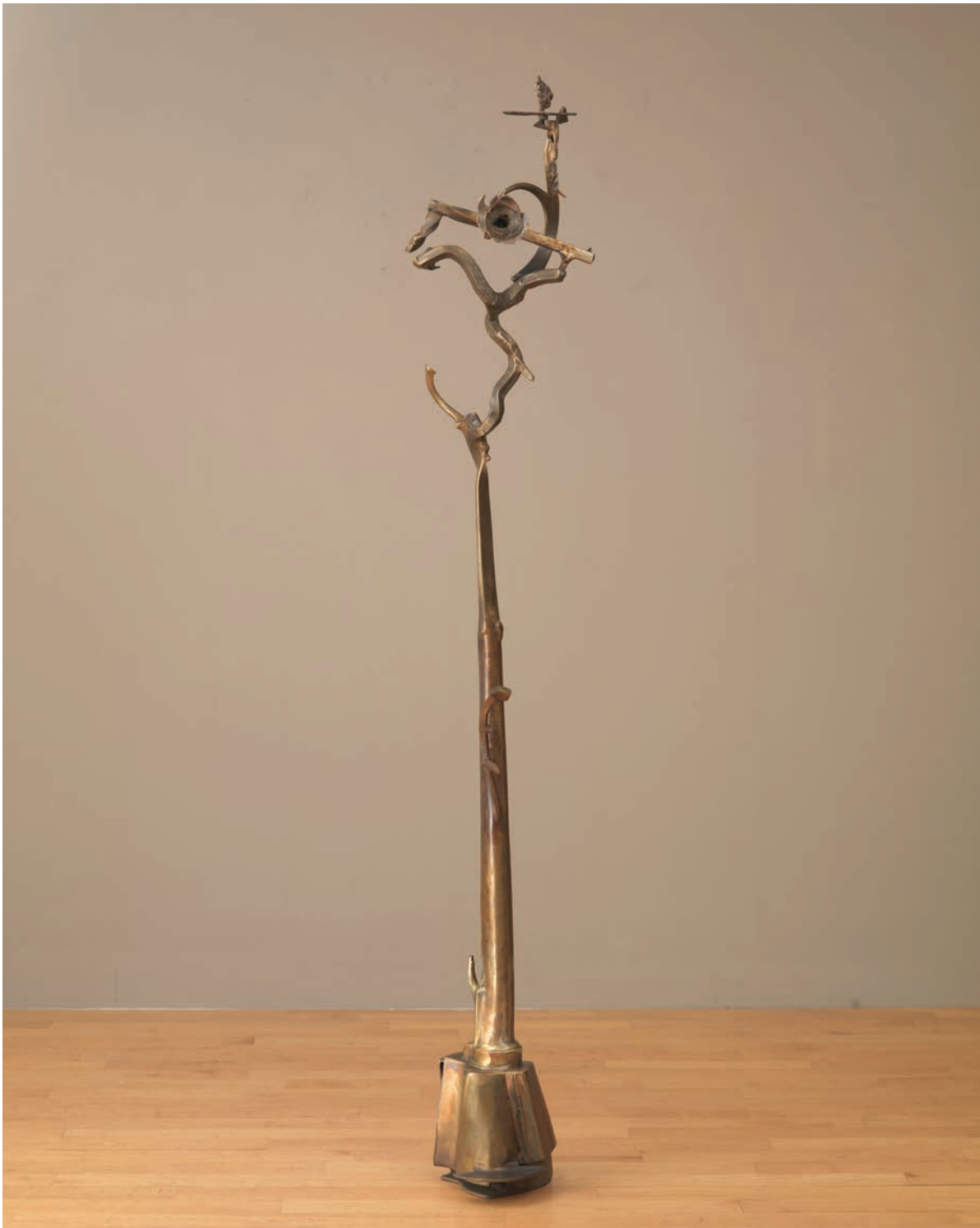
Gaterose Hybrid , 2000 Cast and welded bronze 78" h x 10 1/2" w x 13 1/2" d