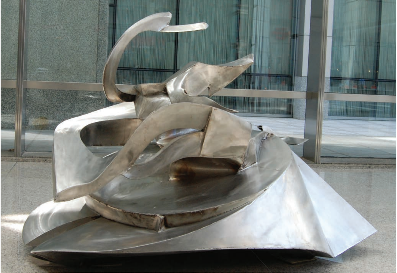
Low Flight , 2001 Welded stainless steel 48" h x 72" w x 84" d

Throughout Hunt's career, the most recurring motif in his sculpture has been the hybrid to connect his melding of disparate elements with the theme of metamorphosis. For him, the hybrid functions as a visual metaphor for his aesthetic and conceptual processes that involve his use of fire to manipulate metal, and thereby reconcile the organic with the industrial. 1 He often presents the hybrid as a combination of abstract human, bird, fish, animal, or plant transformed into expressive fantasy creatures positioned vertically as they emerge out of a formally integrated pedestal or base.