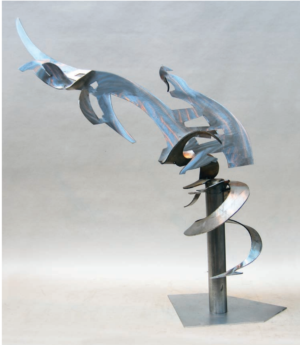
Columnar Construction, Concept III, 2010 Welded stainless steel 48" h x 14" w x 33" d