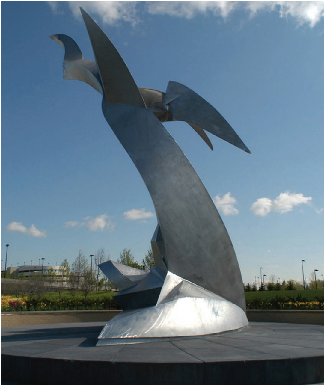
Flight Forms , 2001 Midway Airport, Chicago, IL

Richard Hunt's welded stainless steel Flight Forms was installed at Chicago's Midway Airport in 2001. It is 30 feet high, the height the Federal Aviation Administration allows for such works. Flight Forms unites a variety of forms in an upward-sweeping composition that suggests the defiance of gravity and the dynamism and wonder of flight. The sculpture's grand scale balances the scale and character of the airport's architecture. It is highly visible to passing motorists and provides an engaging experience for pedestrians. Flight Forms is a project of the Public Art Program of the city of Chicago.