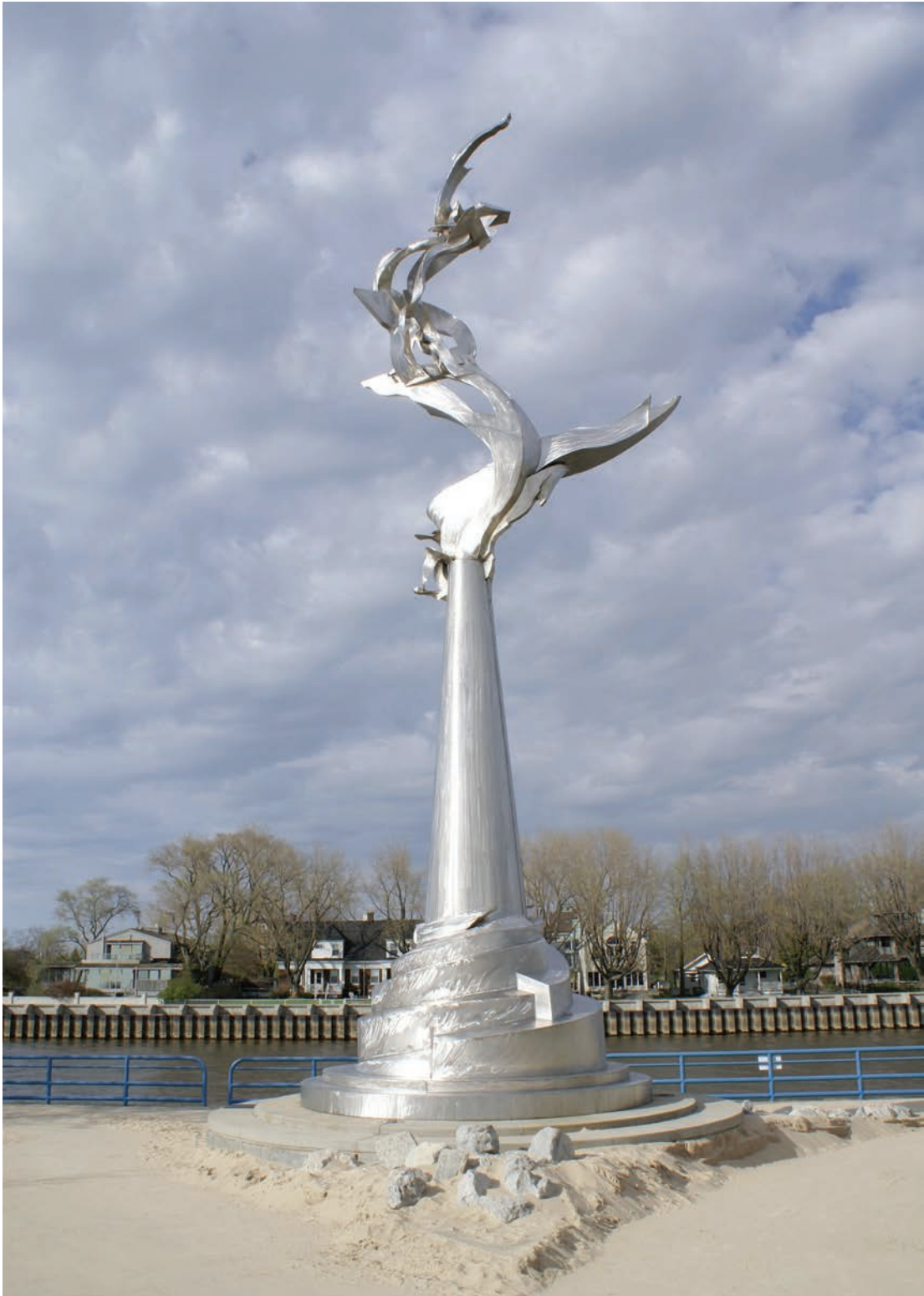
And You, Seas, 2005 Silver Beach Park, St. Joseph, MI