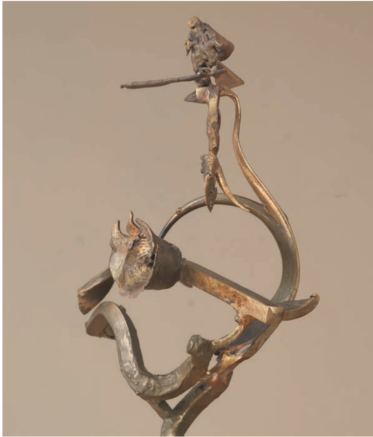
Gaterose Hybrid, detail