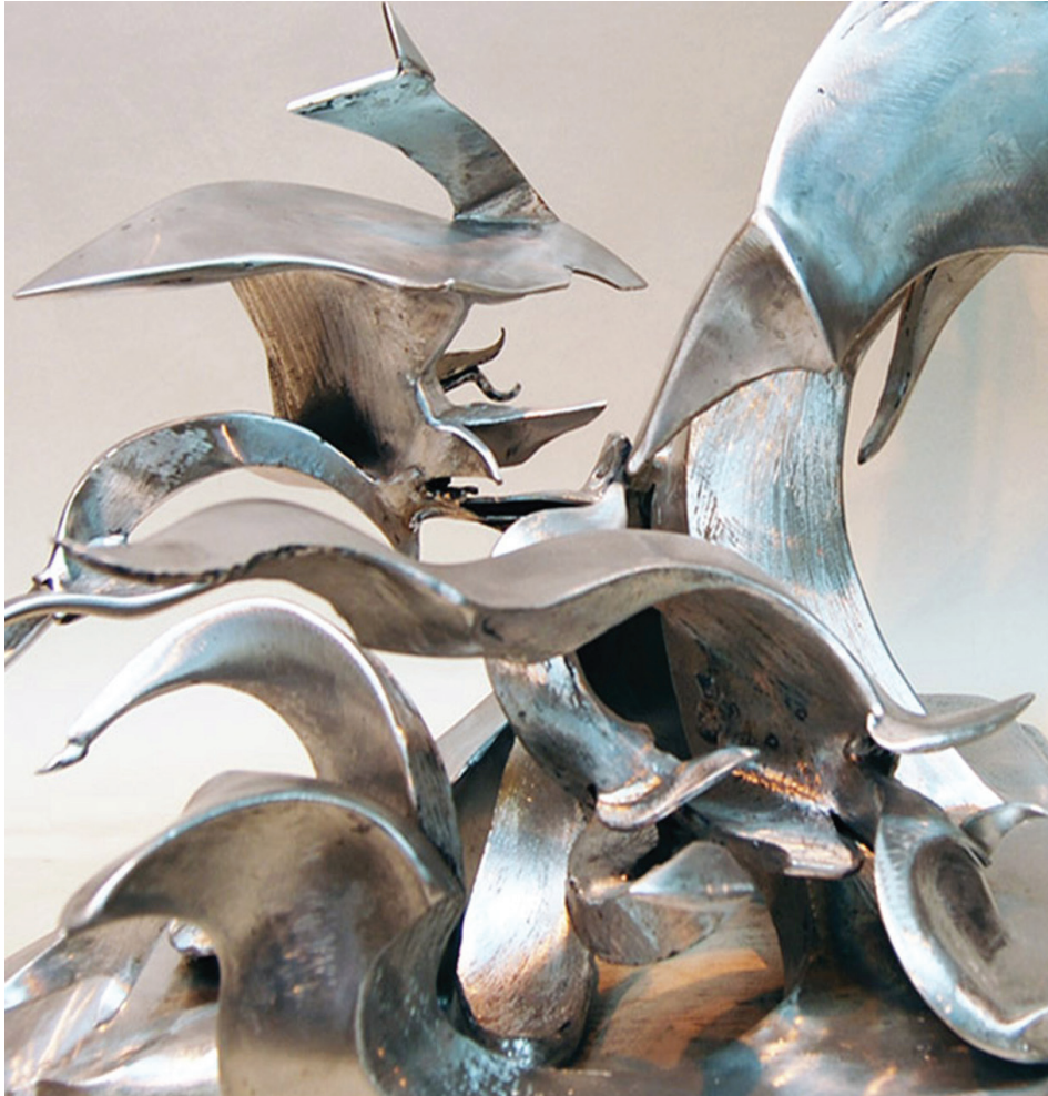
Angel Tide, detail