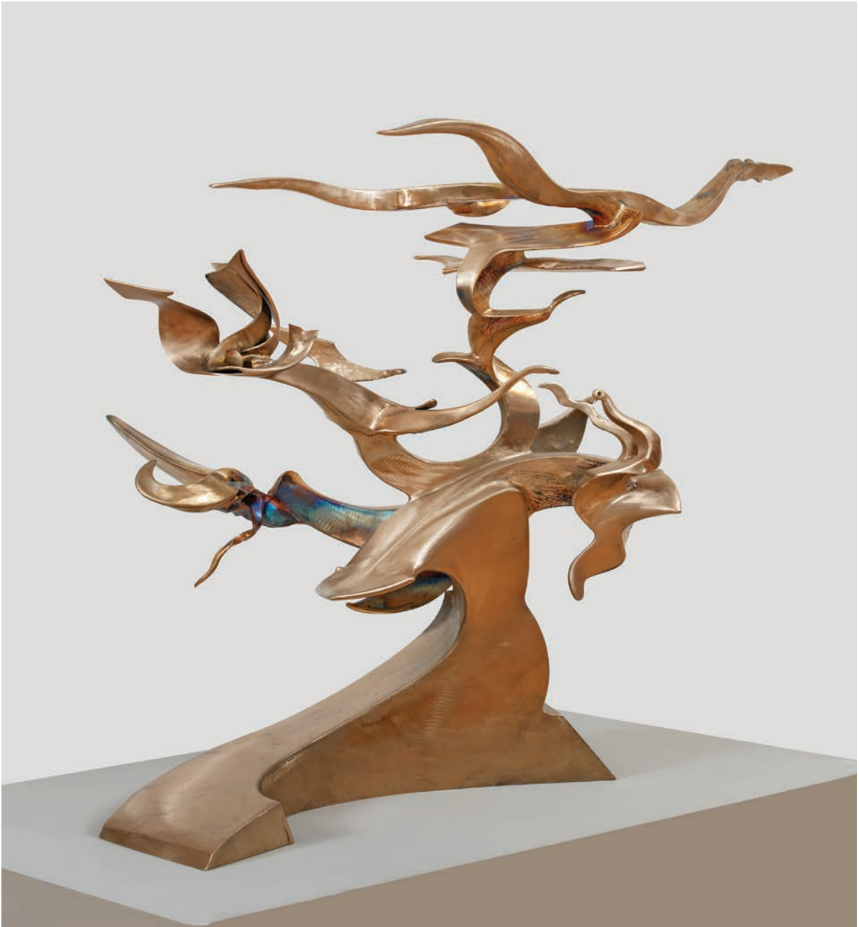
Nile Journey , 2009 Welded bronze 33" h x 22" w x 34" d