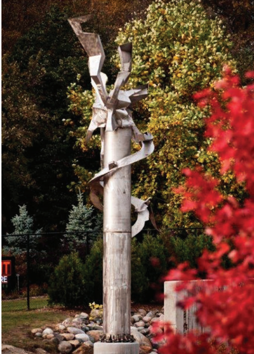
Columnar Construction , 2011 Mott Foundation, Applewood Estate, Flint, MI