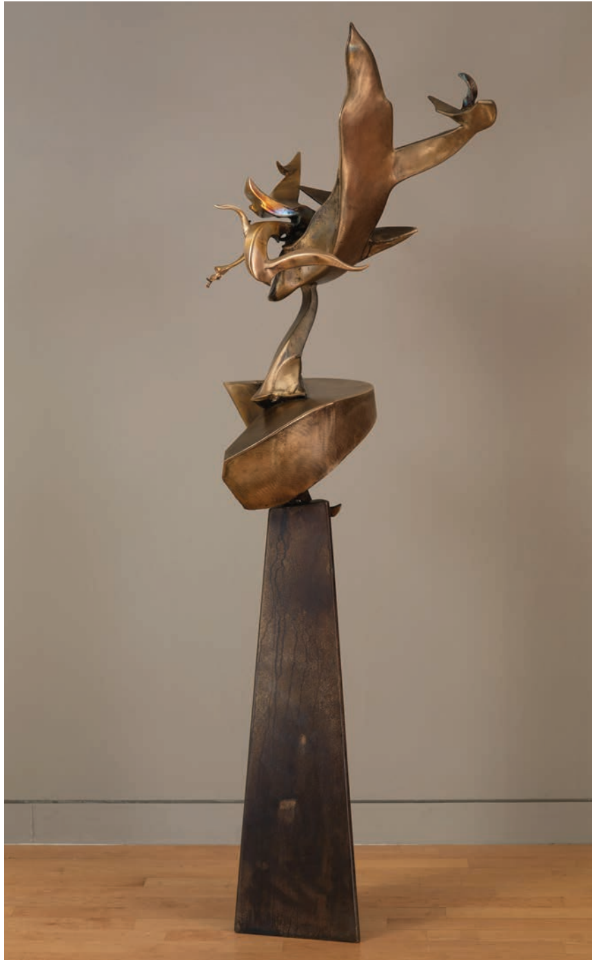
Poseidon, 2008 Welded bronze 75" h x 29" w x 27" d