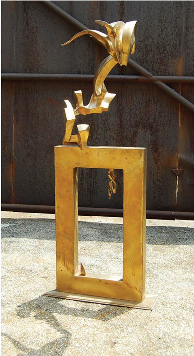
Inside and Outside the Frame, 2006 Welded and cast bronze 72" h x 30" w x 20" d