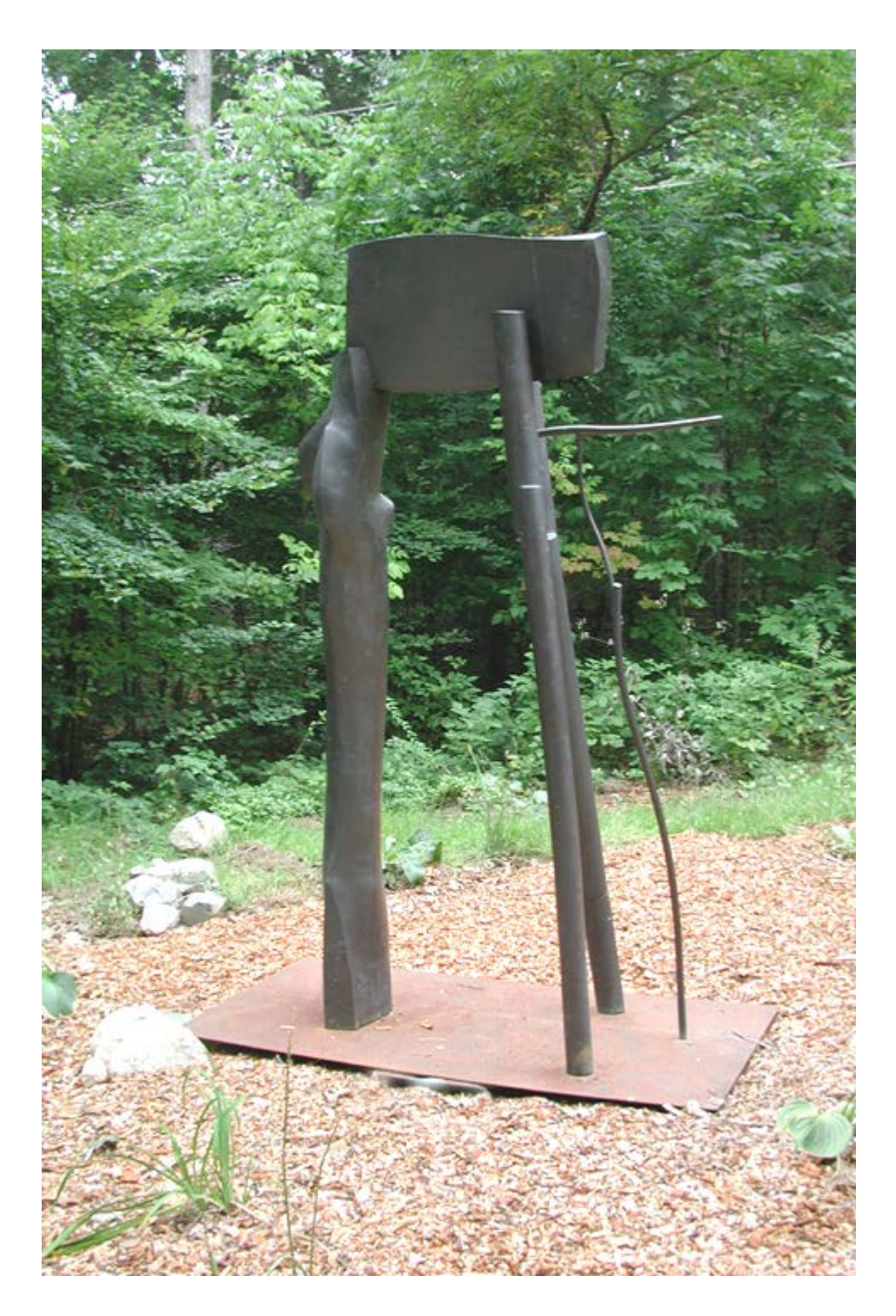
Brass Quartet, brass on steel plate, 8' 3" h x 5' 6" w x 3'd, 1993