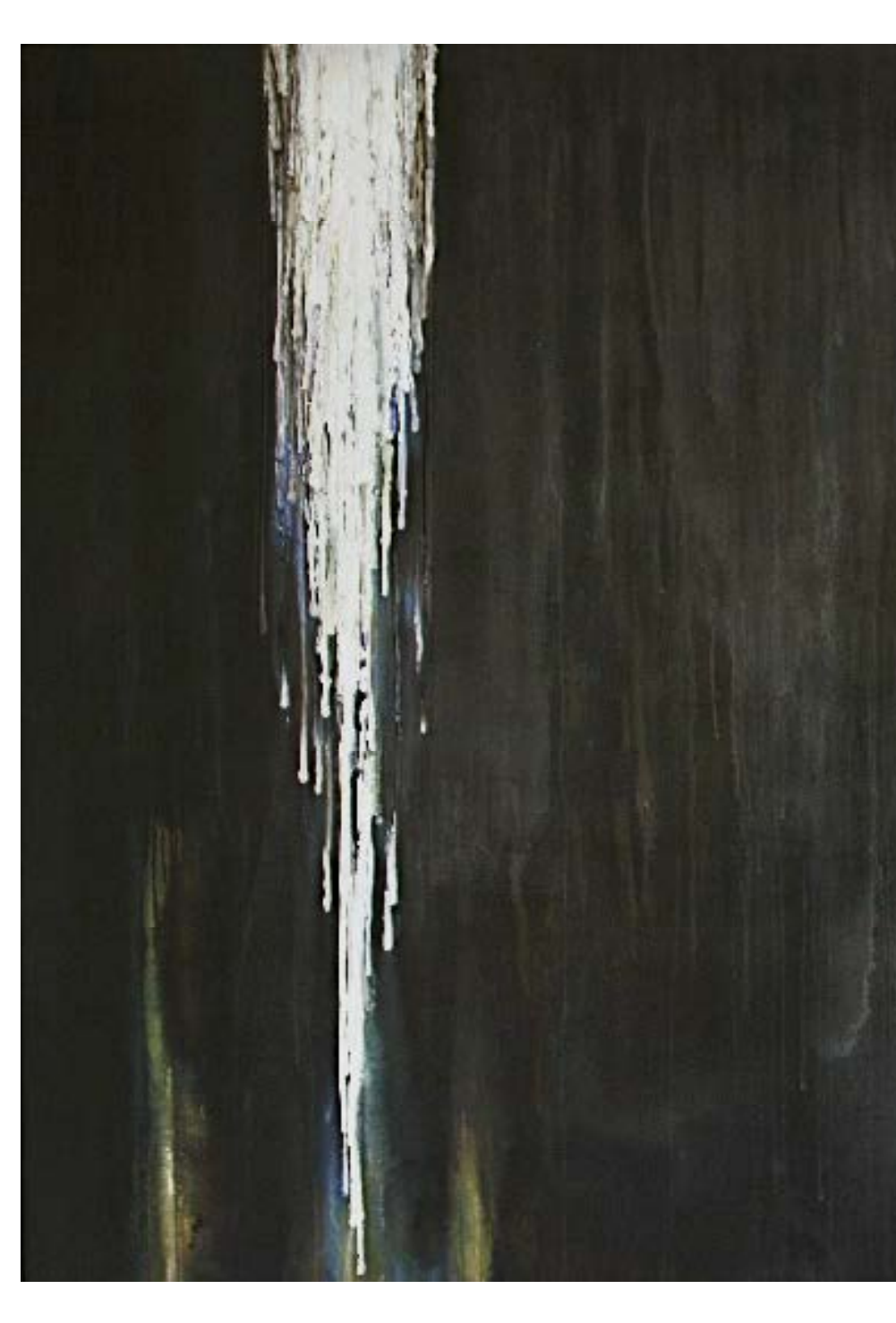
Silent Grotto IV, acrylic on canvas,