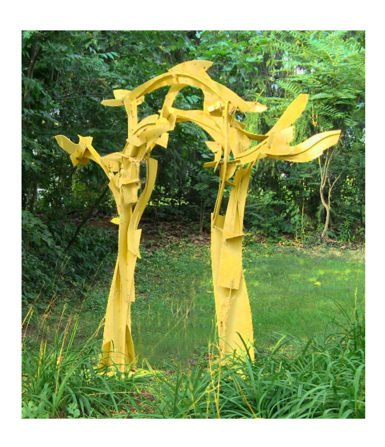
Unfolding Gate, painted aluminum, 8′ 6″h x 9′ 6″w x 2′ 2″d, 1998