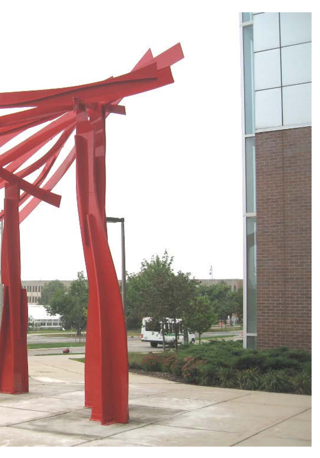
16^\prime h \times 16^\prime w \times 16^\prime d , 2008, Michigan State University, East Lansing, MI