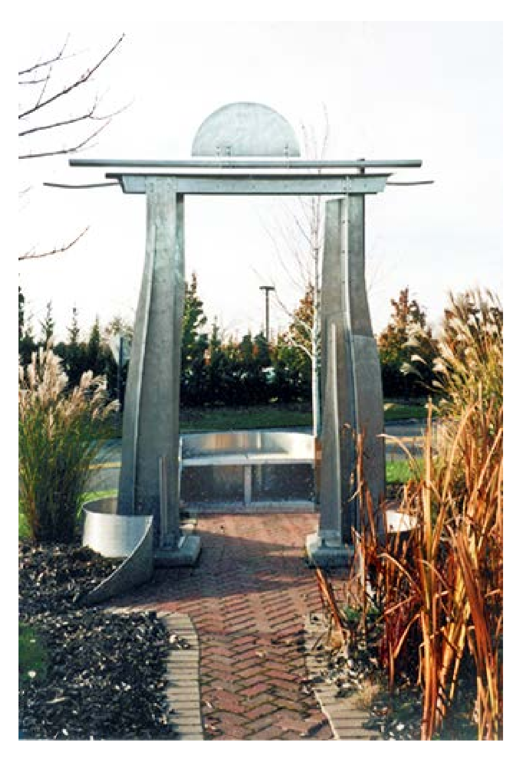
Gate, aluminum, 12'h x 11'w, 2001, Ford Community and Performing Arts Center, Dearborn, MI