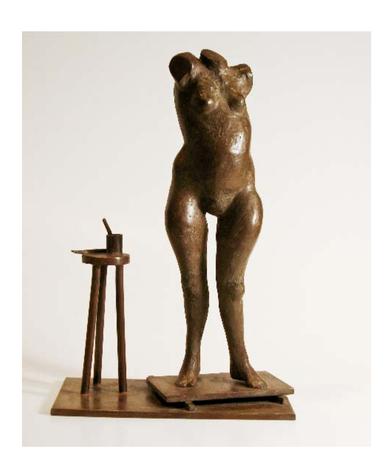
Figure with stool, cast bronze, 10 ½"h x 7"w x 4"d, 2007