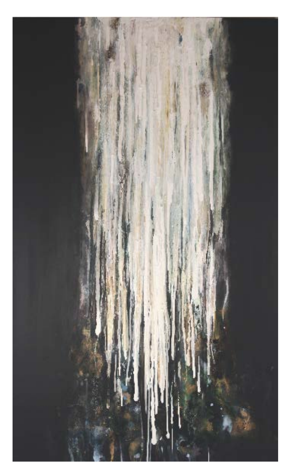
Stalactite II, acrylic on canvas, 5'h x 3'w, 2007