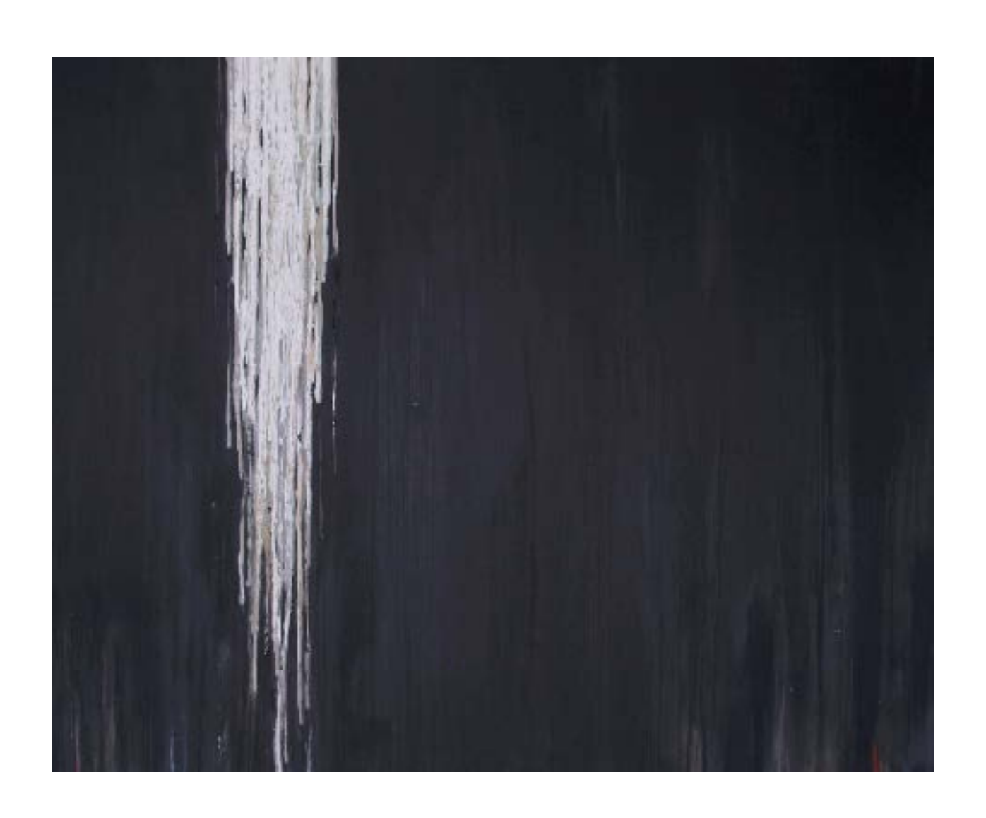
Silent Grotto III, acrylic on canvas, 4'h x 5'w, 2008