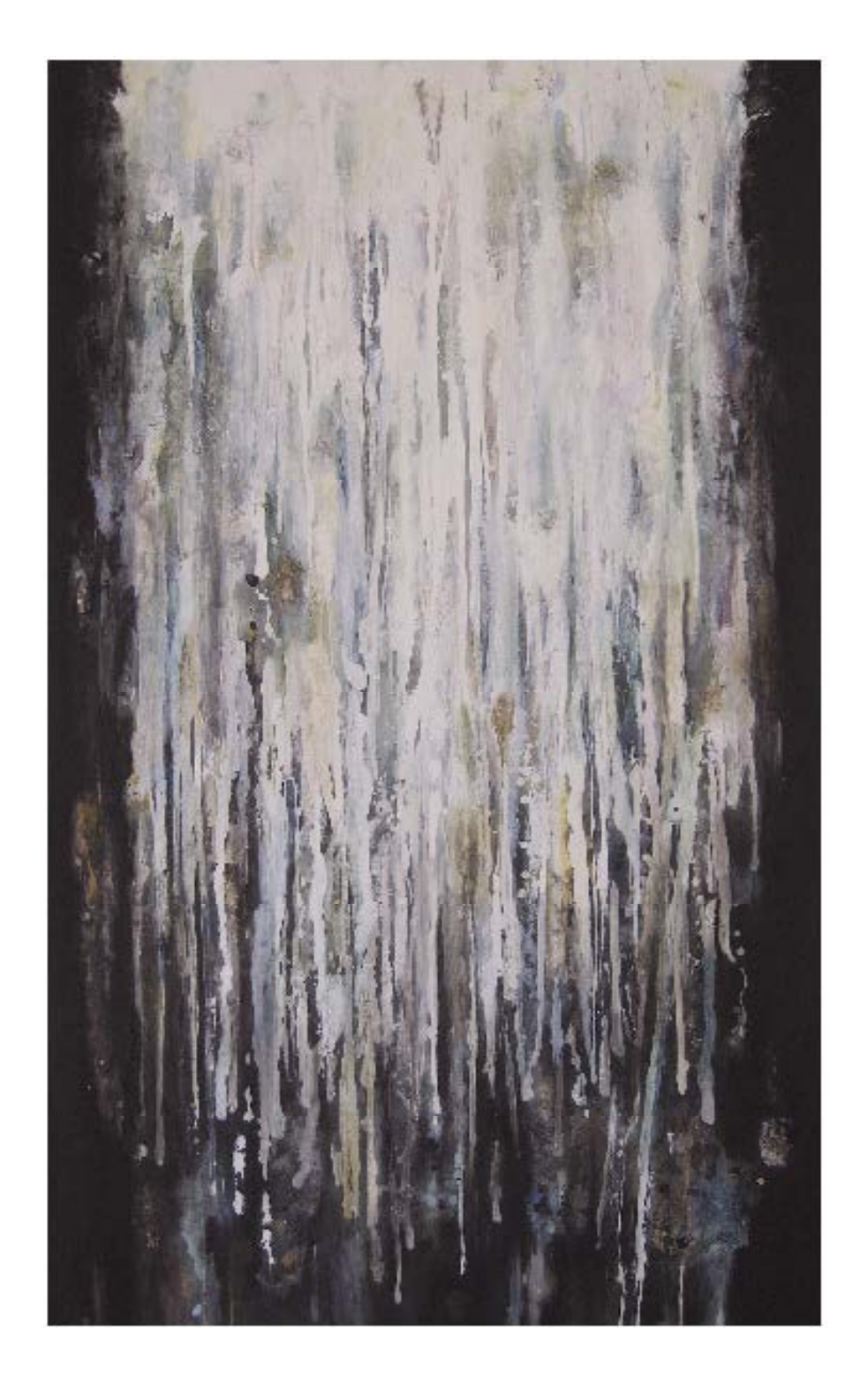
Stalactite I, acrylic on canvas, 5'h x 3'w, 2007