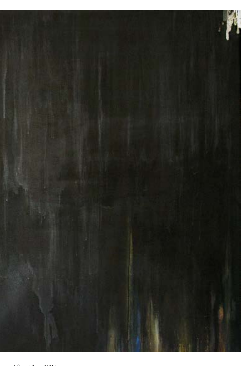
5'h x 7'w, 2008