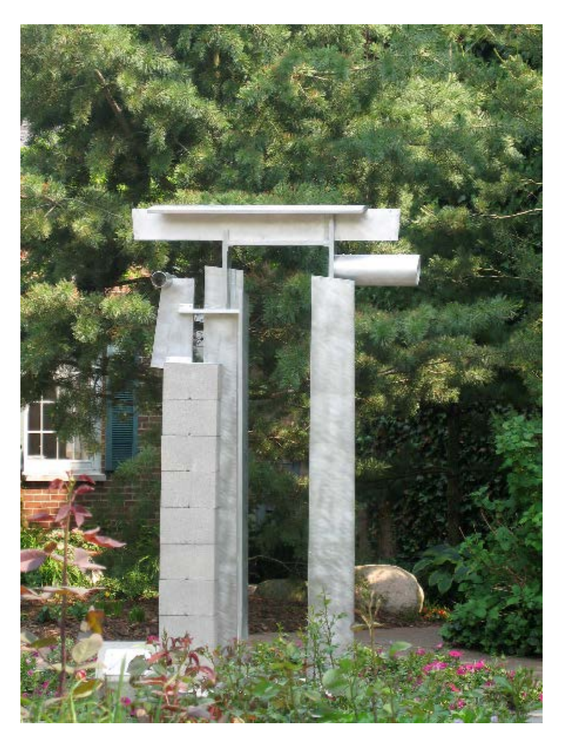
Sentinel II, aluminum and concrete block, 8′ 6″h x 5′w x 1′ 6″d, 2007, Saugatuck, MI