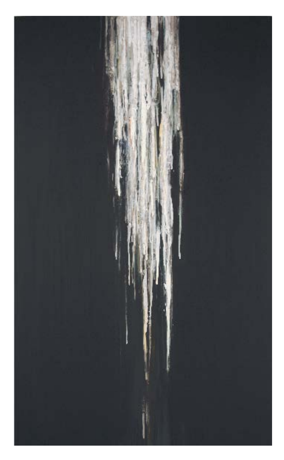
Grotto I, acrylic on canvas, 5'h x 3'w, 2008