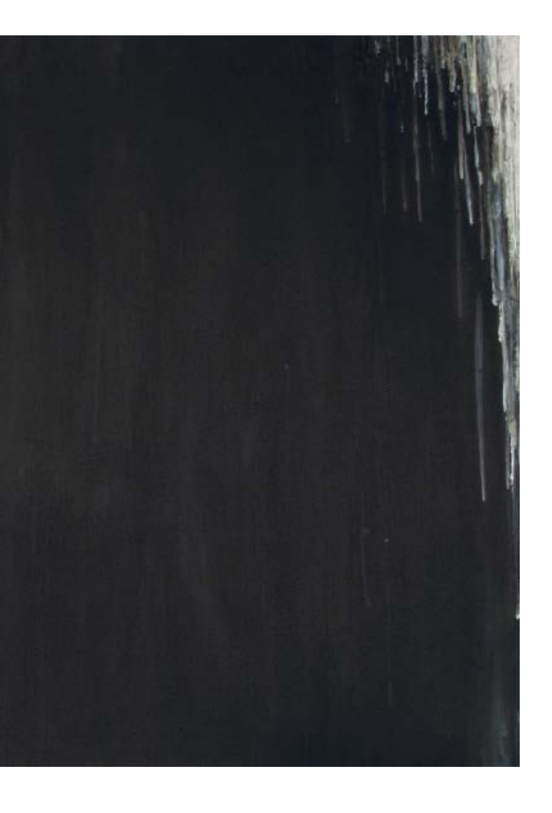
5'h x 7'w, 2008