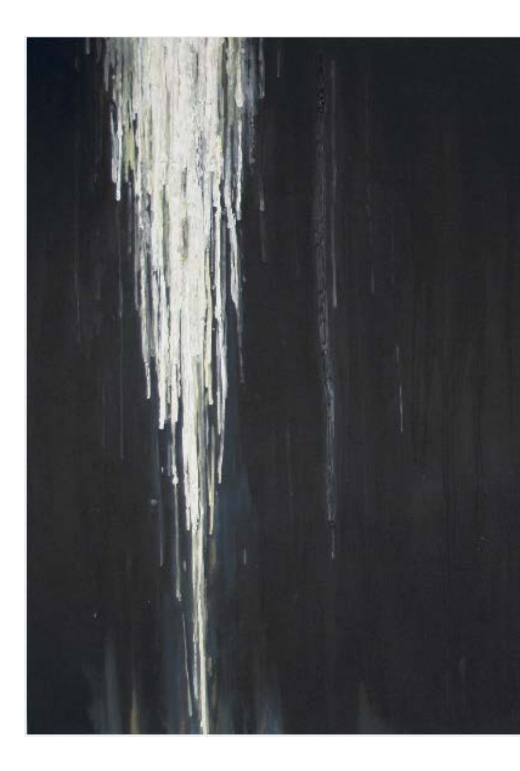
Silent Grotto I, acrylic on canvas,